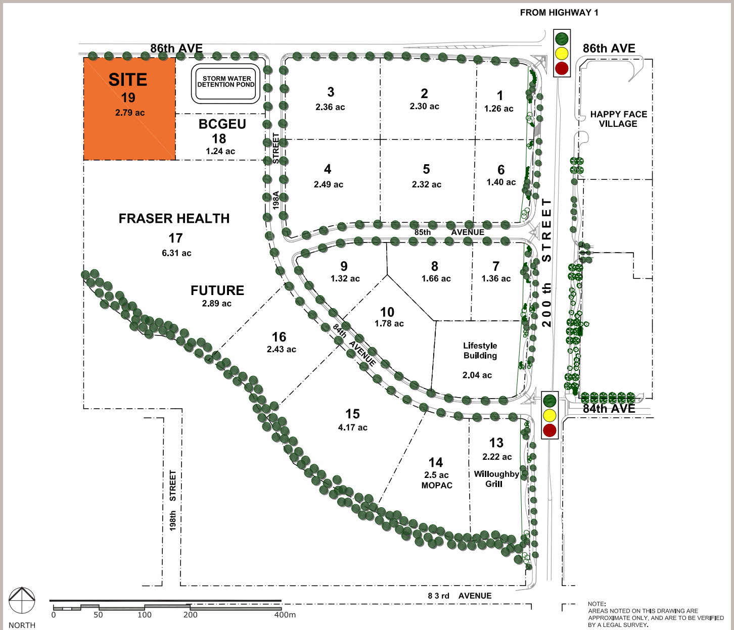
GATEWAY 200 - Lot 19 Lot Site Plan